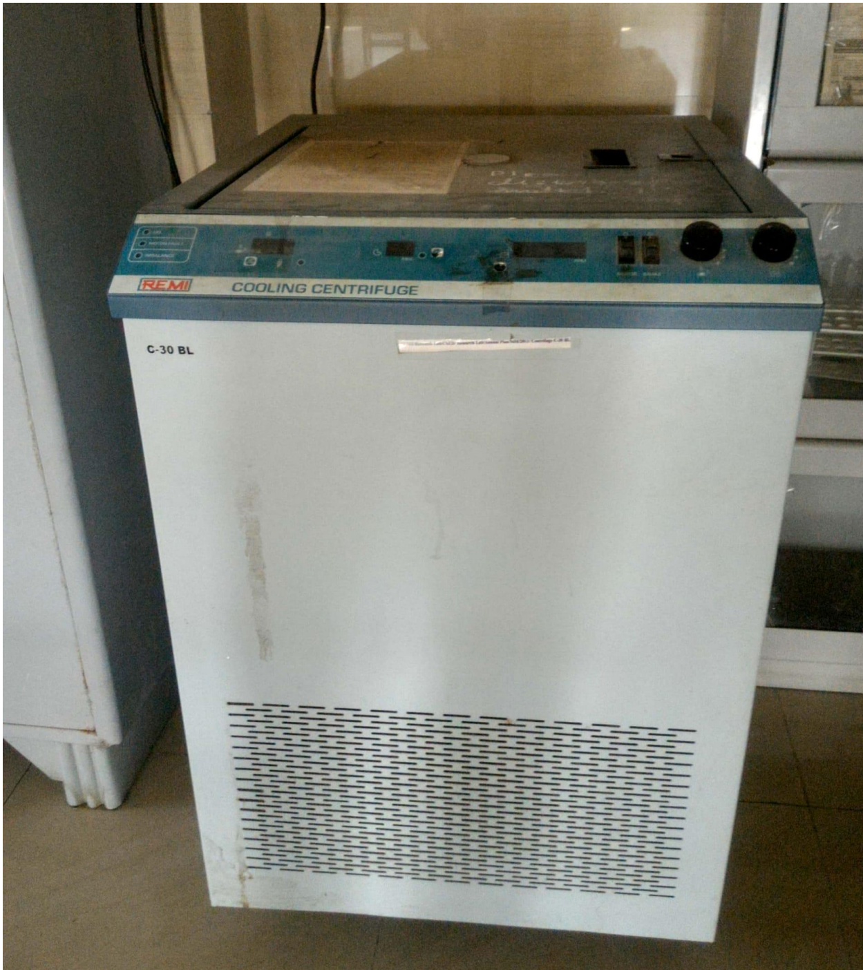
Set up 4: Cooling Centrifuge