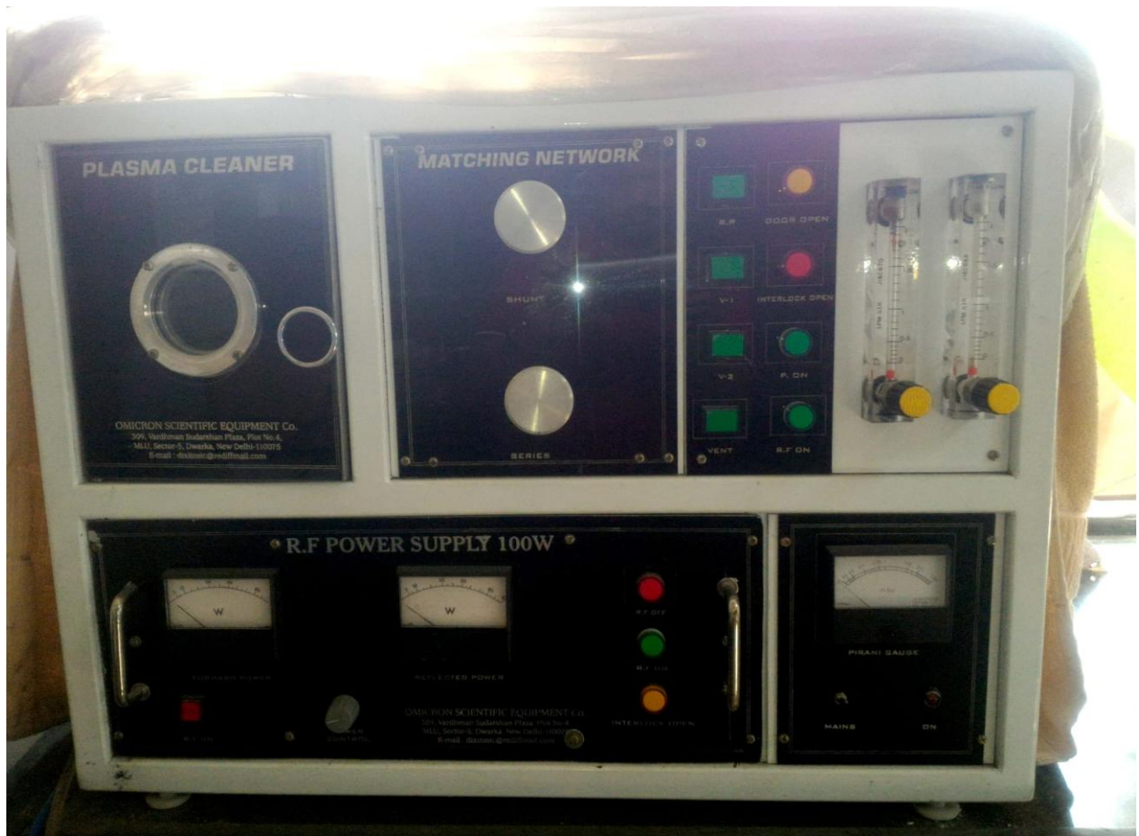
Set up3: Plasma Cleaner