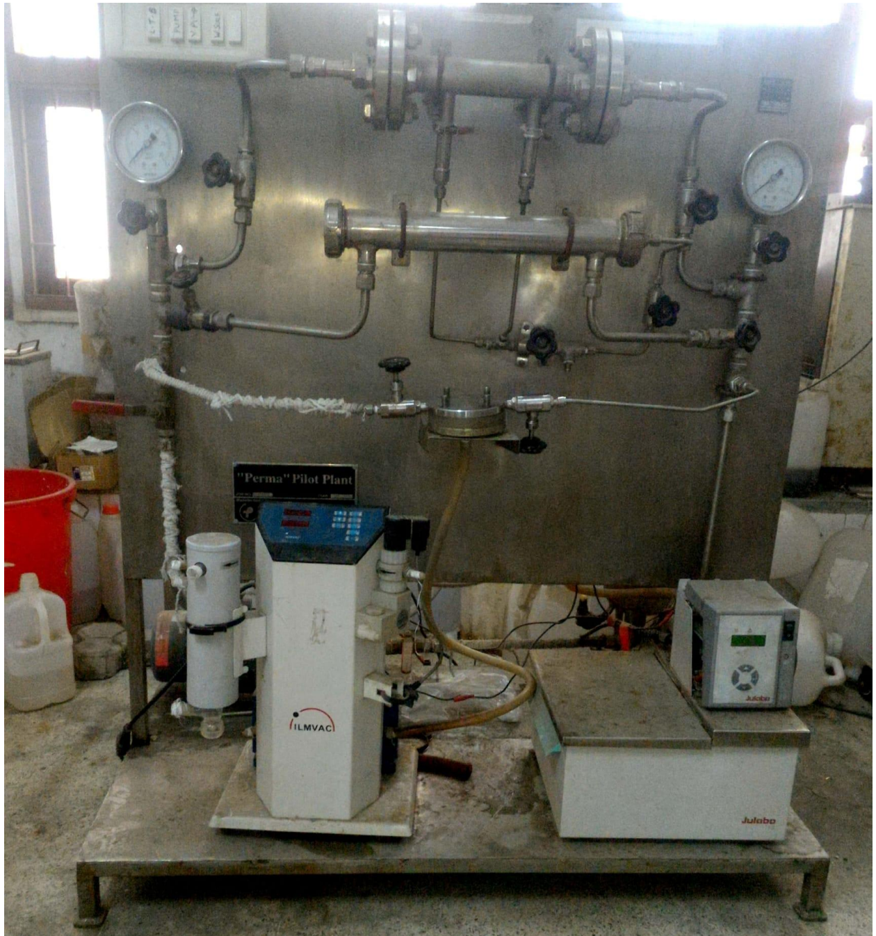
Set up 1: Lab Pervaporation Set up (Perma Pilot Plant)