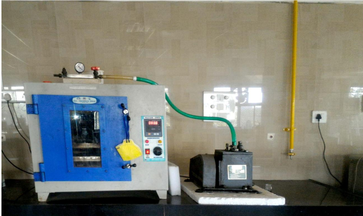
Set up 5: Vacuum Oven