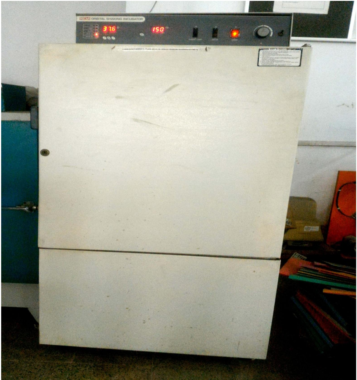
Set up 4: Orbital Shaking Incubator