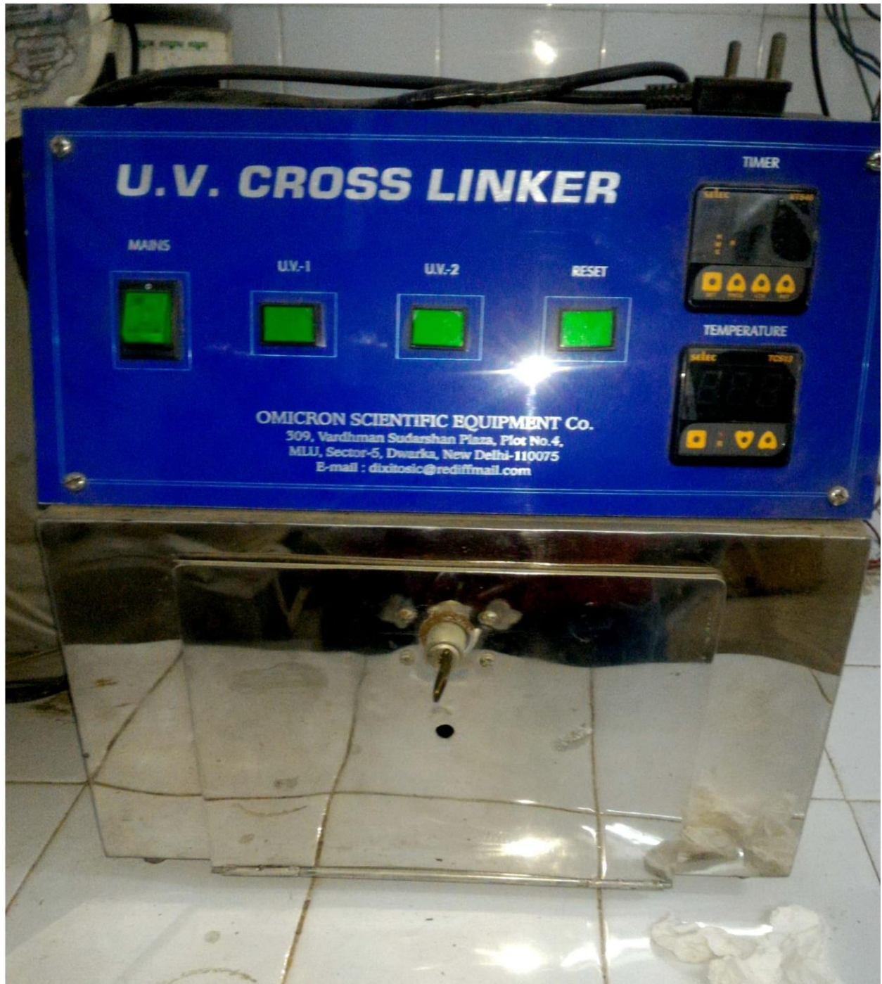
Set up 6: U.V. Crosslinker