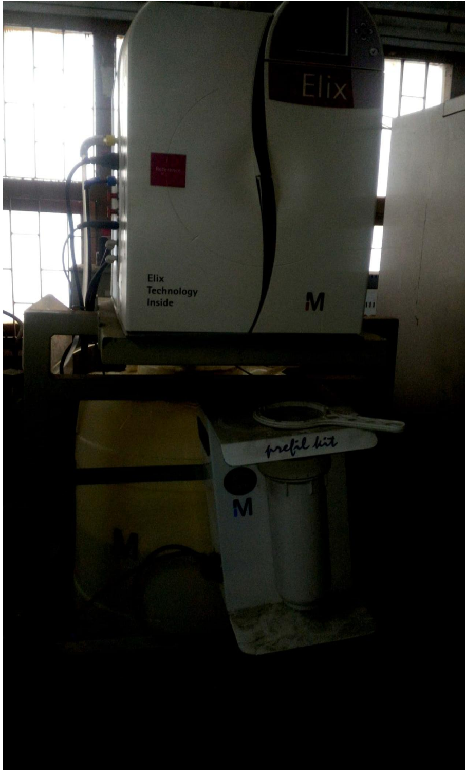
Set up 2: Elix Millipore